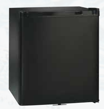
Solid Black Door

www.MinibarSystems.com DOC0262_GuestFridge_50_Slim_CS_SBD