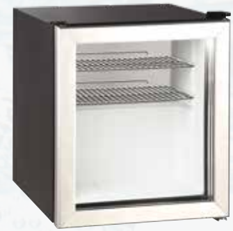
Stainless Steel Glass Door

**Average energy consumption per 24 hours, at 25°C (77°F) ambient temperature and 7°C (44.6°F) cooling temperature, in compliance with EN ISO 7371.