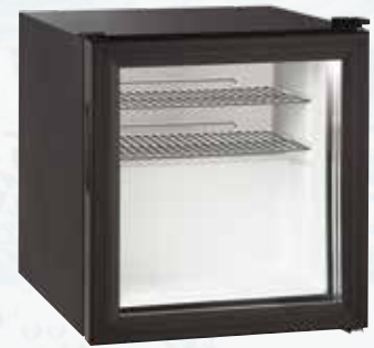
Black Frame Glass Door

**Average energy consumption per 24 hours, at 25°C (77°F) ambient temperature and 7°C (44.6°F) cooling temperature, in compliance with EN ISO 7371.