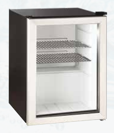
Stainless Steel Glass Door