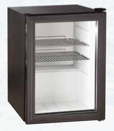
Black Frame Glass Door