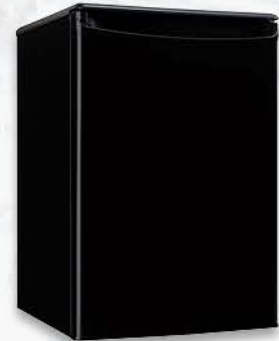
Solid Black Door