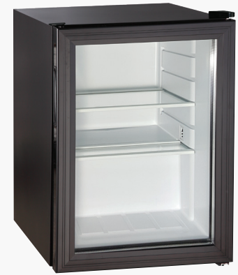
Black Frame Glass Door