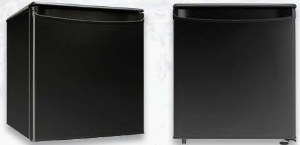
Solid Black Door