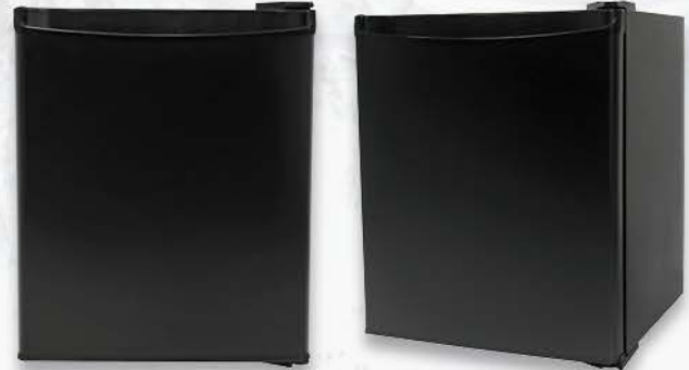
Solid Black Door